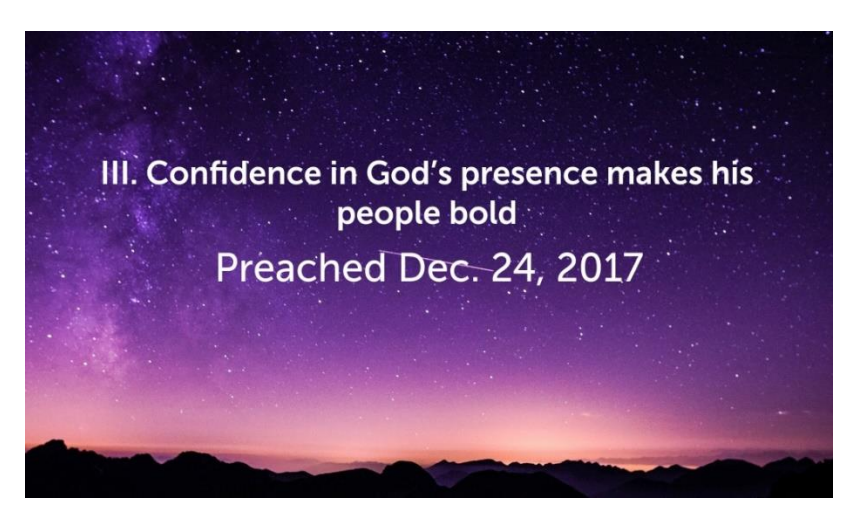
click graphic for presentation of sermon from December 24, 2017

<sup>29</sup> But Peter and the apostles answered, "We must obey God rather than men.