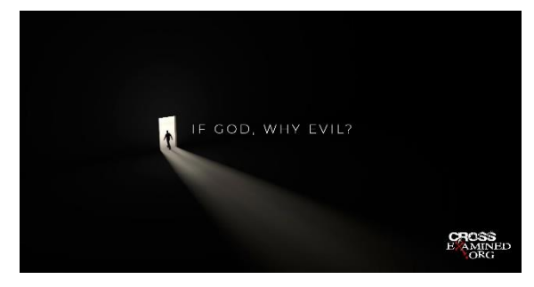
click graphic for presentation 1 Blog